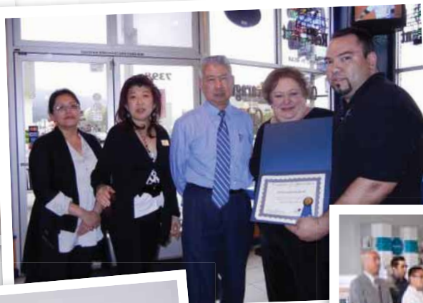
Al Fin Restaurant Small Business Week April 18th