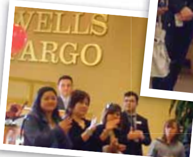
Wells Fargo Bank Mixer May 24th