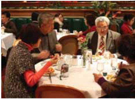
Lucky Chances Casino Small Business Week Breakfast April 20th