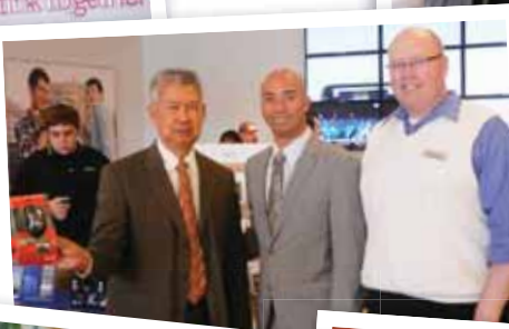
T-Mobile Small Business Expo Small Business Week - April 19th