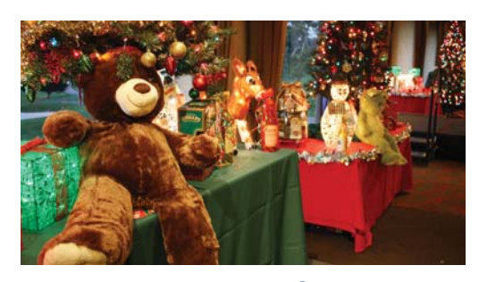
Annual Holiday Soiree & 58th Cypress Business Awards / Installations December 8, 2011